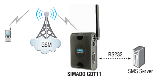
SIMADO GDT11 in SMS Applications

SMS (Short Message Services) is very popular and cheapest communication tool in GSM network. The SIMADO GDT11 can be used for sending and receiving SMS for varied application like order booking, sales promotional activities, logistic, re-filling of vending machines, FMCG Supply, Ticket bookings, AMR (Automated Meter Reading) and other remote devices which can be controlled by SMS.