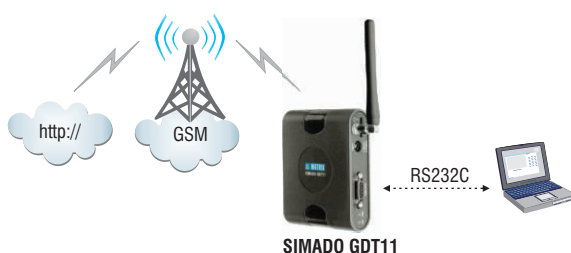
SIMADO GDT11 for GPRS (Internet) Application

Where traditional internet services are not available, GSM network can be used for browsing the internet by using Matrix SIMADO GDT11. Internet connection can be established in no time by connecting computer with COM (RS232C) port provided on SIMADO GDT11. User can surf the internet seamlessly like leased line, if GPRS services is activated from GSM service provider.