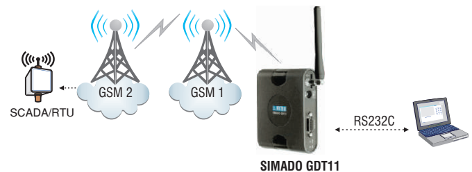
SIMADO GDT11 in Data Acquisition Application

Matrix SIMADO GDT11 can be deploy for online data, acquisition SCADA, Remote login, monitoring and controlling devices. Remotely working device data like level, temperature, pressure, flow, density etc., can be captured in real time using SIMADO GDT11.